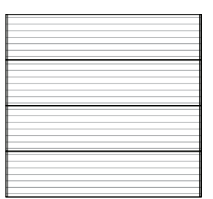
Model 592 Ribbed, textured panel