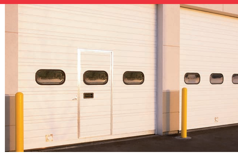
Model 592, Double Thermal Acrylic windows, White paint finish, pass door

With a 17.50 R-value (3.09 W/Msq) and .057 U-value (.324 Msg/W), the Thermacore® Models 592/599 are the energy-efficient door of choice for commercial use. The 592/599 also incorporate a thermal break and joint seal to prevent thermal transfer between exterior and interior door panel skins. The door is designed for the most demanding situations, including high-cycle, wind load and thermal applications. Built with the best technology in the business.