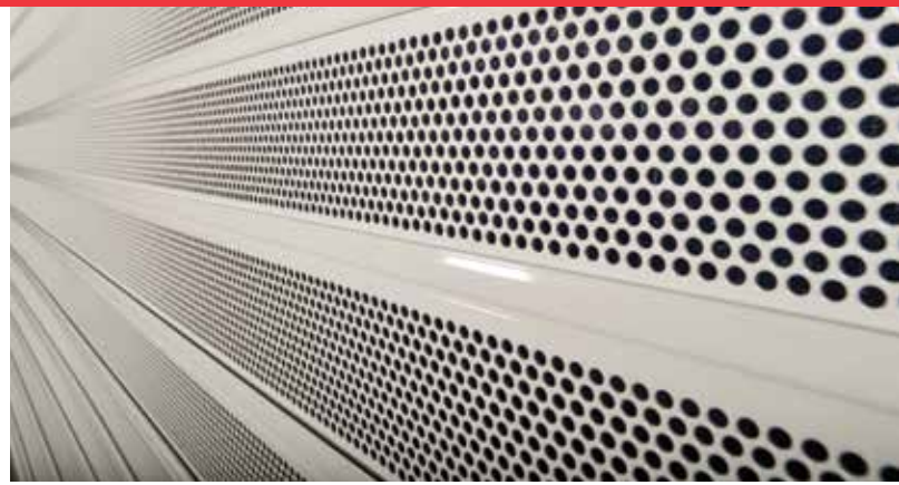
Model 674 perforated aluminum security grille, PowderGuard® Premium powder coat finish in white

When your project calls for an upward-coiling grille that is as versatile and attractive as it is rugged and secure, look no further than Models 670, 671 and 674. These grilles provide an attractive yet functional means to secure areas where public access is restricted, without blocking air, light or visibility. These grilles are an ideal choice for interior or exterior use in a variety of retail, industrial and commercial settings.