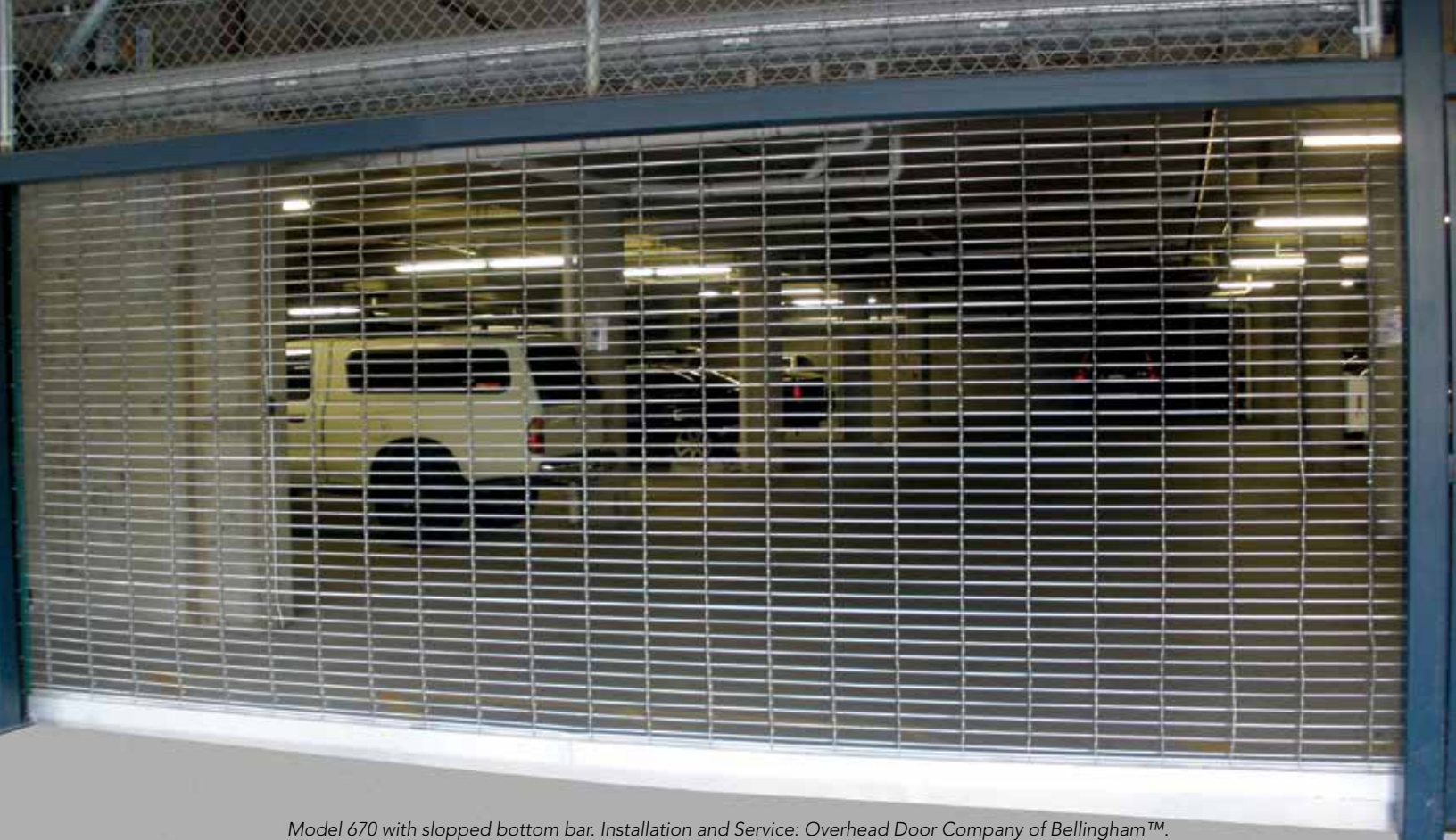
Model 670 with sloped bottom bar. Installation and Service: Overhead Door Company of Bellingham™.