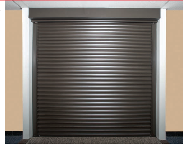
Standard slat, PowderGuard® Premium powder coat finish in Bronze

Allura® Model 653 is a next generation light-duty door solution that is versatile enough for specialty uses and has a space-saving design, making it perfect for installations with limited side room and headroom. Multiple perforation and fenestration options allow for many configurations with the right amount of light and air passage.