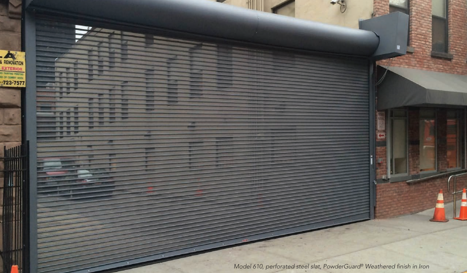
Model 610, perforated steel slat, PowderGuard® Weathered finish in Iron